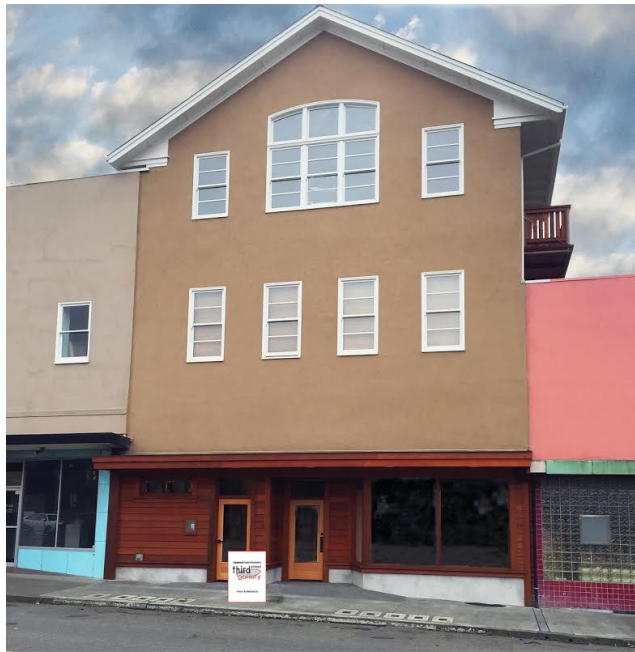
Humboldt State University Third Street Gallery 416 Third Street, Old Town, Eureka, California 95501