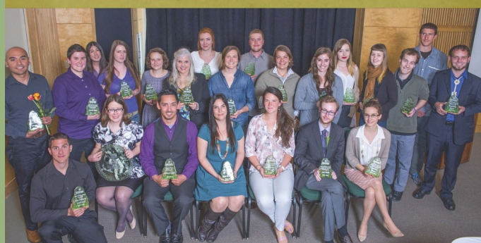
2015-2016 Outstanding Student Award Recipients

AWARDS WILL BE PRESENTED APRIL 12, 2017 • 3 PM • KATE BUCHANAN ROOM