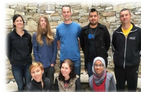
HSU participants in the 30 th Annual Student Research Competition

This is your opportunity to showcase your research or creative endeavor, represent HSU, and compete for a cash prize!