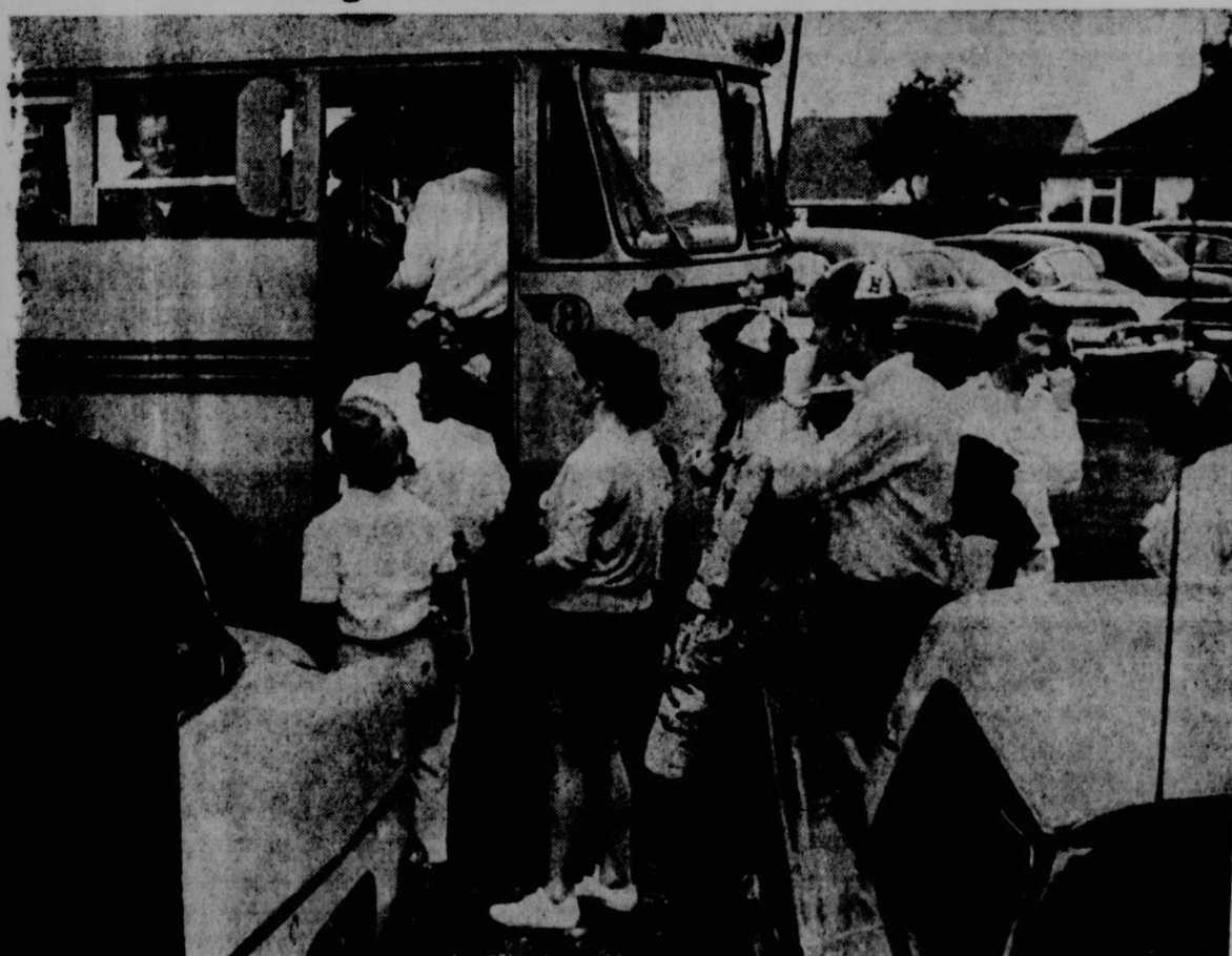
Humboldt State freshmen load a picnic during the three-day old on campus last weekend.