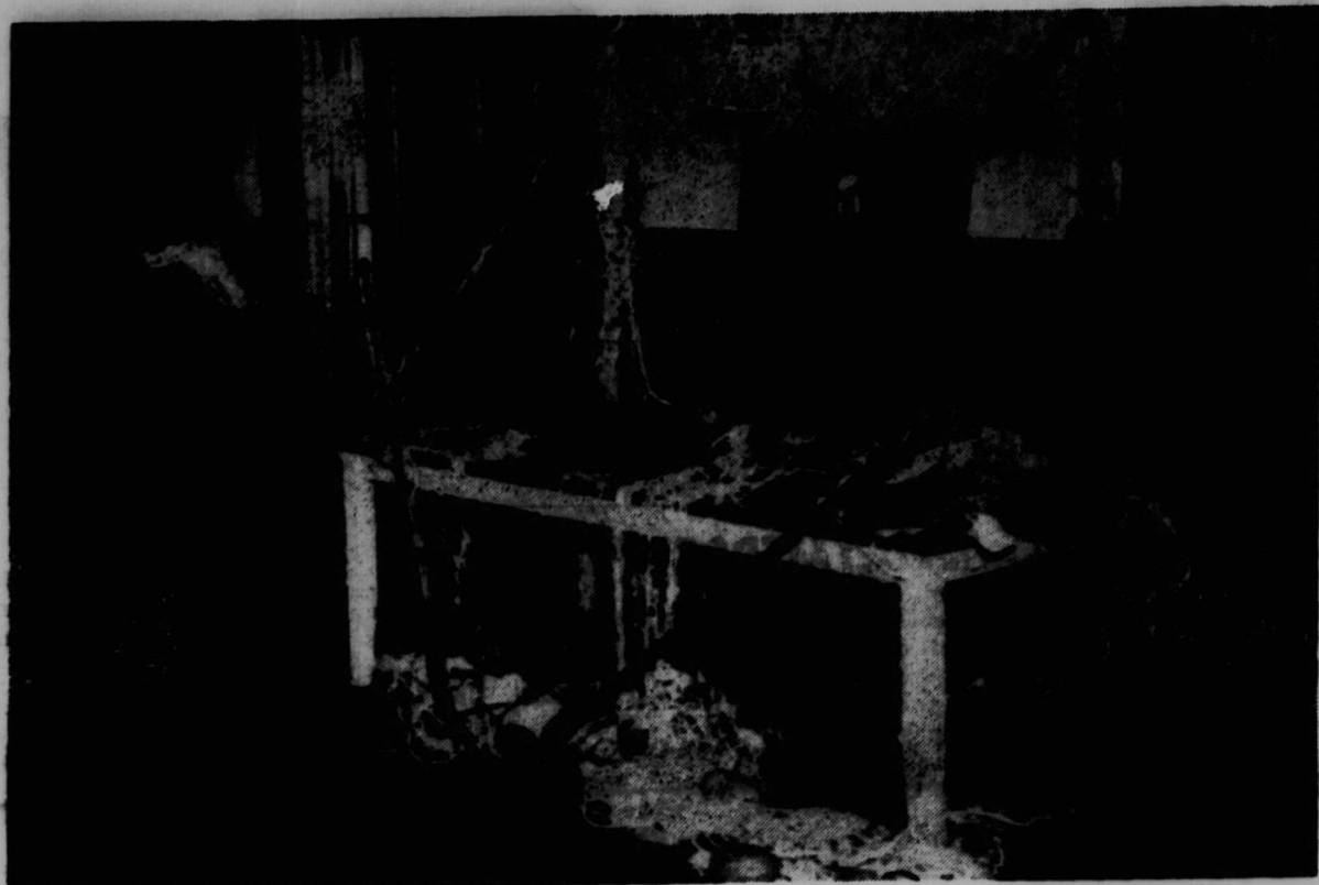
One of the many exhibits in the main hall during Wildlife Week, sponsored by Conservation Unlimited was a collection of illegal fishing and hunting equipment confiscated by the California Division of Fish and Game.