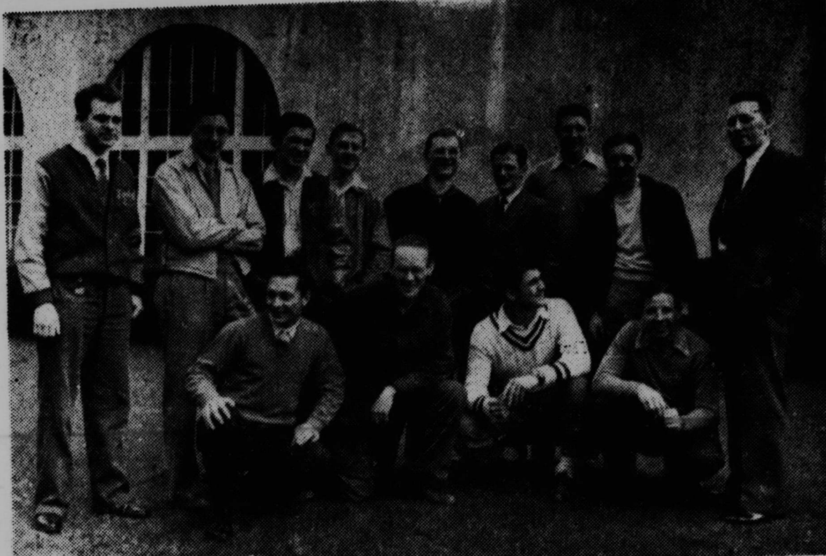
Pictured above are Humboldt State's victorious cagers—winners of the Far Western Conference Title.