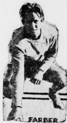
Brilliant end plays last game For Lumberjacks