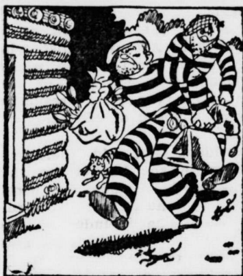
Georgia was settled by thieves and animals taken from the English jails.

BONERS are actual humorous tidbits found in examination papers, essays, etc., by teachers.