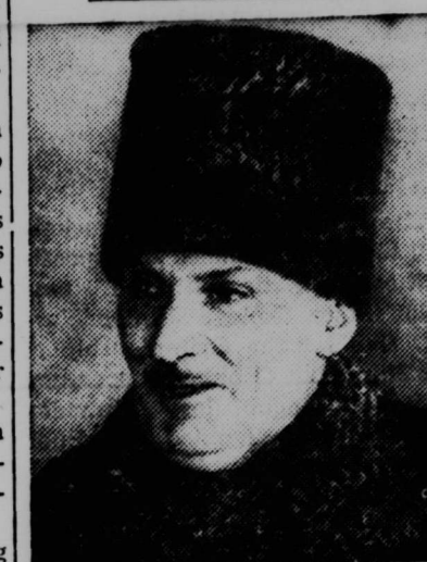
NEW MAN . . . They made a new man of Field Marshal Viscount Montgomery during his visit to Moscow by presenting the hero of El Alamein with a caracul and sable coat and a caracul cap. He doesn't look the same without the familiar beret and sweater.

duceable only by opium get Bunny Berigan's "I Can't Get Started." Nothing but sweet is his trumpet solo and the late Mr. B.'s theme is considered a prize item among instrumental friends and lyric squares alike.