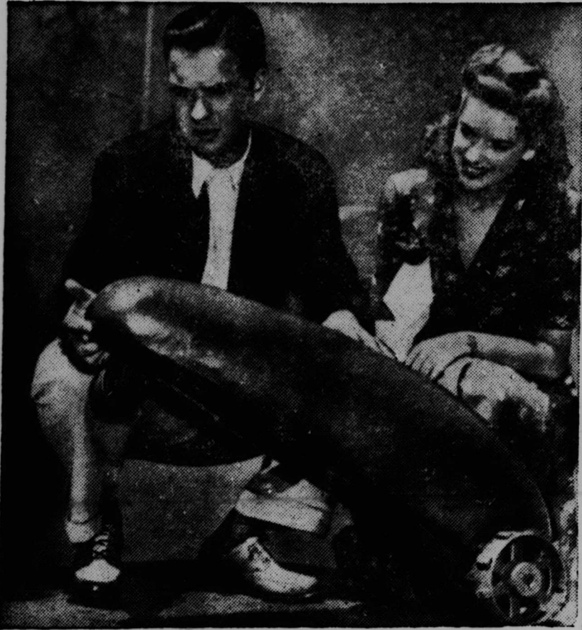
The Crosby Research foundation has announced that they have a solution for the atomic bomb. They need not know where the bomb is coming from. Their defense will prevent its arrival. Shown in the picture is one of the Crosby brothers and helper examining model jet automobile, one of the new products of the Crosby Research foundation, which aided atomic experiments.