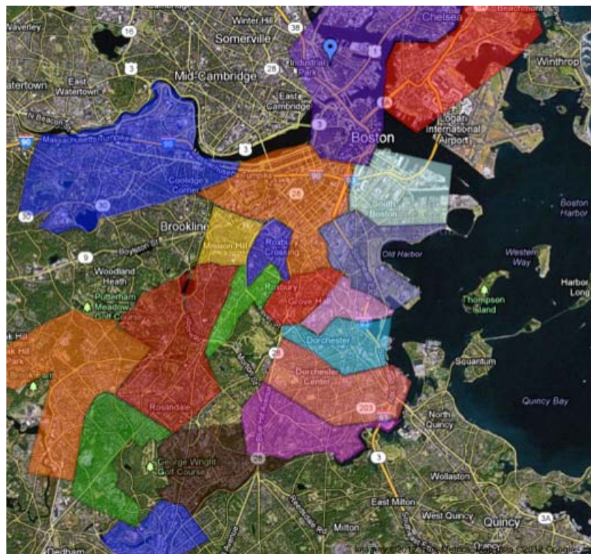
Figure 2: Boston Canvassing Zones

Whether working for legal services, SUN, or City Life, I am often asked, “Why help these people?” We can debate the hardships, blame, and the moral hazard of helping those who borrowed what they cannot pay back. Yet my simple answer is this: consider the alternative. Without both public and private sector intervention and cooperation, the result is a neighborhood of abandoned and boarded-up houses, homeless families, and a continuing downward spiral into further instability. That is a future that no one, including the banks, envisions. Additional resources and information about the movement can be found at projectnoone-leaves.org .