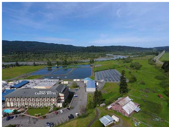
The solar array (right) at Blue Lake Rancheria is part of an innovative microgrid project led by HSU's Schatz Energy Research Center

One of the greatest concerns during power outages is the possible impacts on people whose medical needs require ongoing access to electricity. During the power shutoff, the Rancheria also housed eight people with acute medical needs in its hotel, by request of the County Department of Health and Human Services (DHHS). DHHS credited the Rancheria with saving their lives, due to their critical needs for power. Emergency diesel was also provided to United Indian Health Services to power the backup generators that keep perishable medicines cold.