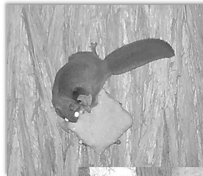
Left: Humboldt Flying Squirrel