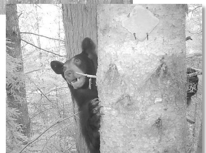
Bottom: Bear attracted to the peanut butter suet bait at Headwaters Forest Reserve