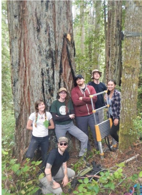
Graduate students setting up camera traps with peanut butter suet bait at Headwaters Forest Reserve

This research is ongoing and they are working to develop additional methods to survey for this cryptic, nocturnal species including using ultrasonic recorders similar to those used for bats. Because if flying squirrels weren't unique enough, they also emit ultrasonic vocalizations!