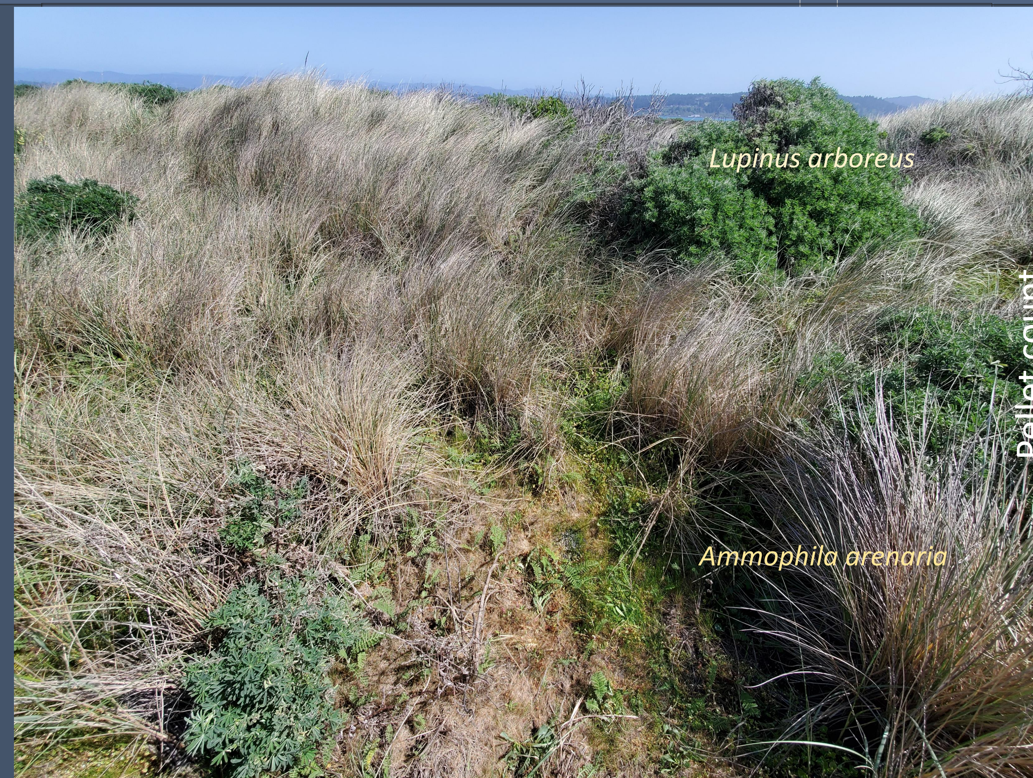
Figure 1. Invasive plants ( L. arboreus , Ammophila arenaria ) inhabit much of California's coastal dunes. A pile of deer pellets can be seen in the center.