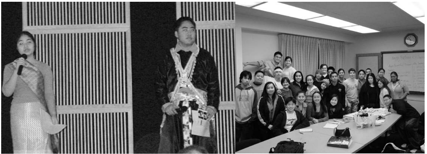
APASA finishes organizing the Asian Purposeful Dinner.