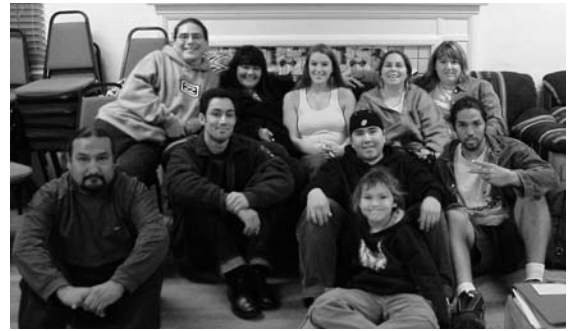
Members of AIA relax after another successful Indigenous People's Week! Go AIA!!!