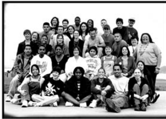
2000 Diversity Conference Staff and Volunteers

The Cultural Times is the official newsletter of the HSU MultiCultural Center. It is funded by the Associated Students of Humboldt State University. The views expressed in the content of The Cultural Times are not censored or reviewed by the Associated Students. The Cultural Times invites students, staff, faculty, and community members to contribute to contribute work and share experiences and points of view. All correspondence regarding this publication should be sent