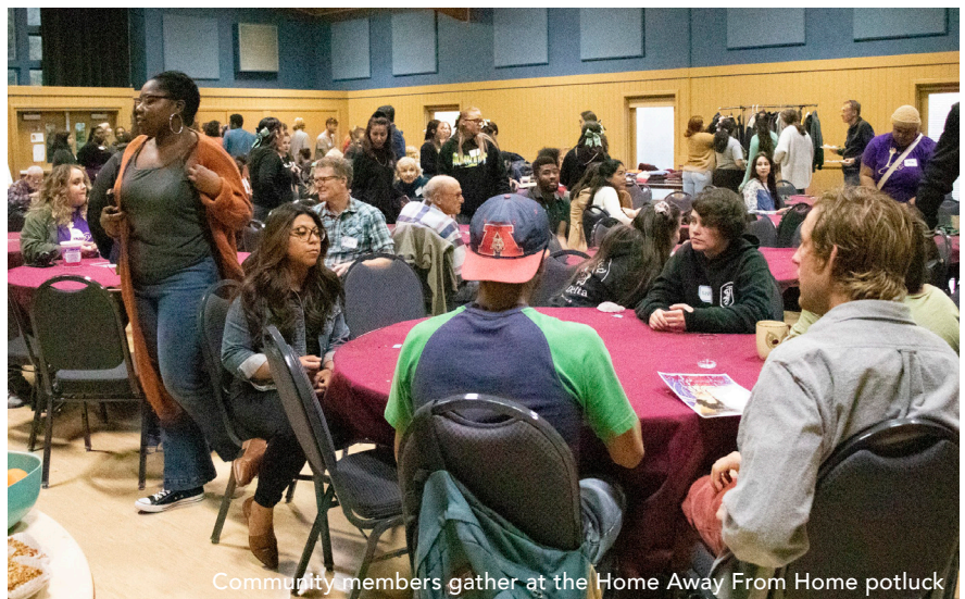
Community members gather at the Home Away From Home potluck

The 26th annual IPW brought members of the community together, and showed the type of unity that it’s volunteers and participants aim to create. People came together and learned about Indigenous culture and history, and by gaining new knowledge and understanding, were able to grow as a community.