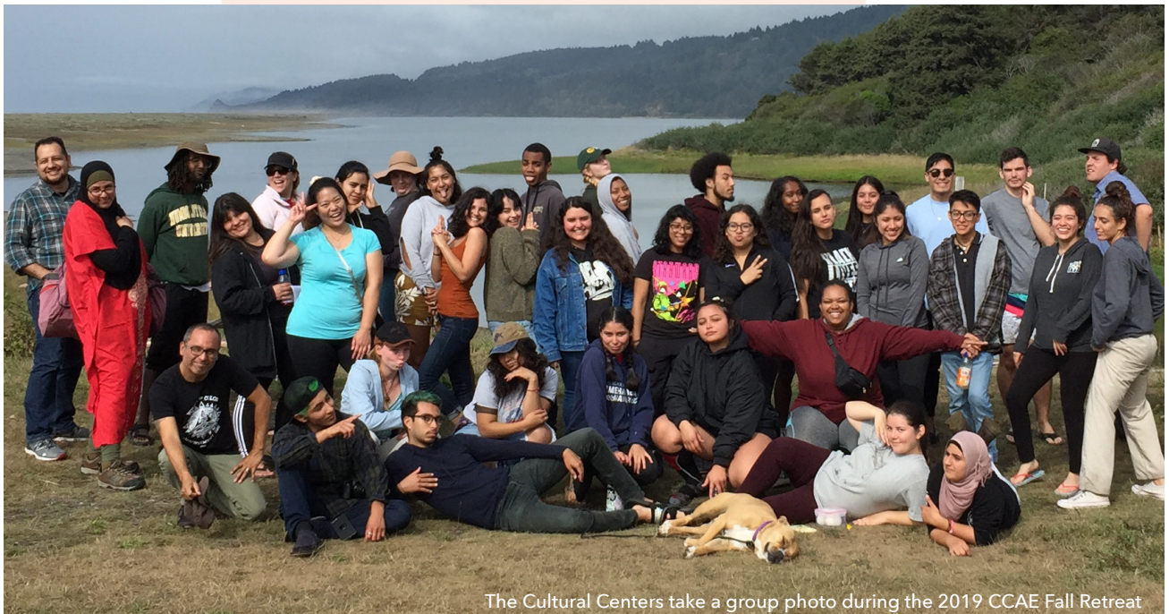
The Cultural Centers take a group photo during the 2019 CCAE Fall Retreat