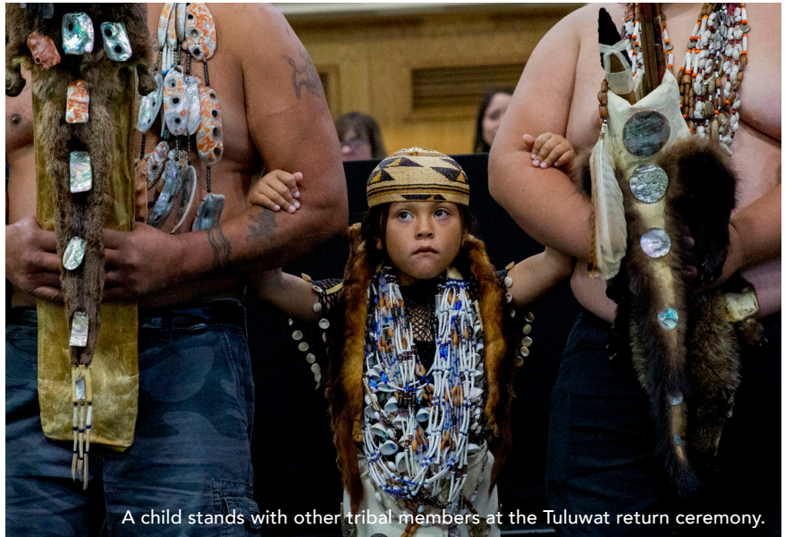
A child stands with other tribal members at the Tuluwat return ceremony.

The Eureka City Council spoke on behalf of the motion, each member contributing a unique perspective to the magnanimity of the event.