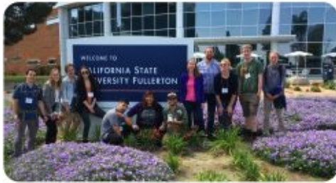
HSU participants in the 33 rd Annual Student Research Competition

HUMBOLDT STATE UNIVERSITY OFFICE OF RESEARCH AND SPONSORED PROGRAMS