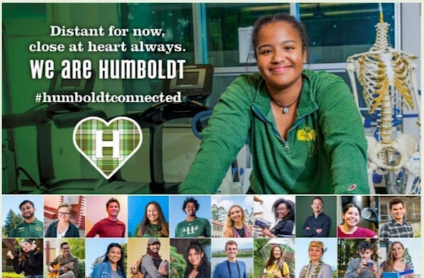
Image Description: Student sitting in a classroom with the words "distant for now, close at heart always. We are Humboldt. #Humboldt Connected". Additional images of various students on the bottom of image