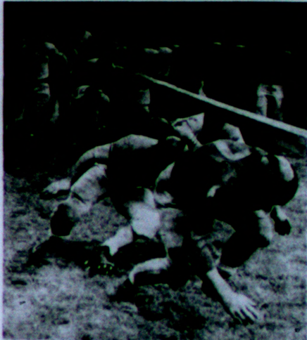
Lumberjack griders weave in and out around a rail on part of an obstacle course which the team goes through in conditioning exercises during the noon-time practice. Also included in the courses are a steel "monkey bar" and some hurdles.