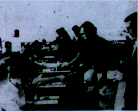
A group of students pass through one of the many steps in the registration procedure on the last semester saw a record number of students enroll at HSC. Nearly 1,500 students registered on the first day alone.

According to statistics, since Jan. 1, 1957, the number of paralytic polio cases is 3433 below the 1956 number. The Public Health Service attributes the reduction to the Salk vaccine.