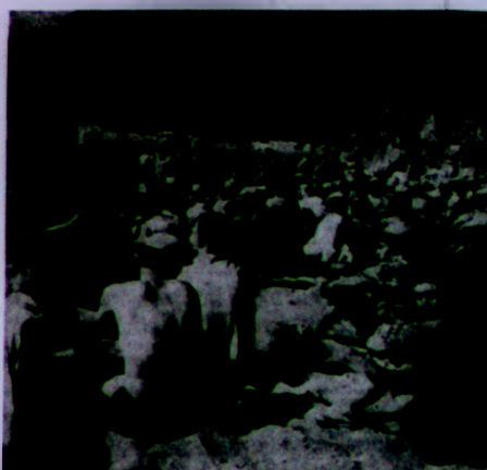
One of the many activities students at the third annual Fresh Camp enjoyed was the outing at College Cove, Sunday Sept. 8. Here a large group of freshmen are watching fellow students pot on skits. (See story on page one)

The college carillon was dedicated five years ago during the half-time period of a HSC-Pacific Lutheran College football game.