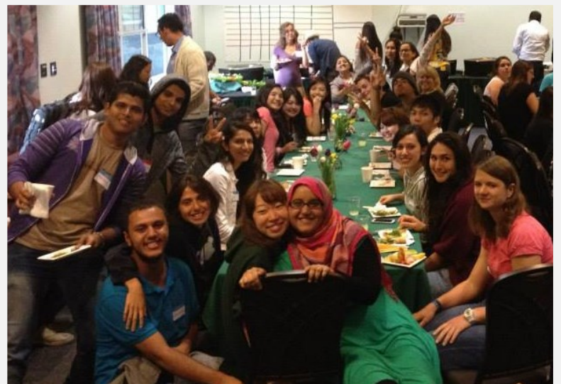
Right: Students, faculty and staff enjoy the Welcome Reception and great food!