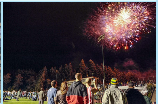
Left: 2013 International Homecoming Parade Float Center: Students help decorate the float Right: Fireworks after football game.