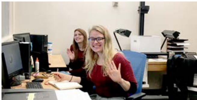
HSU Library Scholar Interns

The HSU Library continues to transform to meet the needs of students, faculty, and staff. This year, we are focused on our goal of providing more students with paid internships that are high-impact, project-based learning opportunities. The new Special Collections will provide an important opportunity for student-paid internships to digitize unique collections that create a story of the past, present, and future. To achieve this, we are asking for support. Your support of $500 will fund one student intern for one semester. You may prefer to name and endow internships in perpetuity for approximately $26,163.