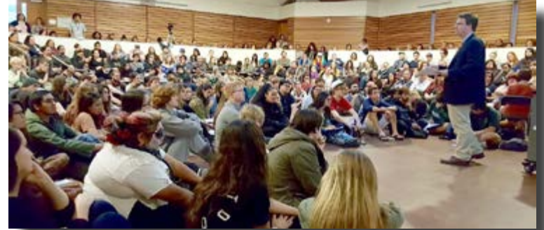
Author Ben Madley Talk 2017 Native American Forum, Behavioral & Social Sciences Building

At the HSU Library we believe that it is our civic responsibility to play an active role on our campus by promoting social justice and providing tools and resources for open dialogue. We strive to empower learners to make a difference.