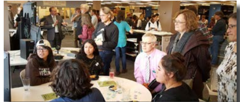
Courage Cuentos Journal Launch Party 2017 digitalcommons.humboldt.edu/courageouscuentos Humboldt Scholars Lab, 3rd floor Library