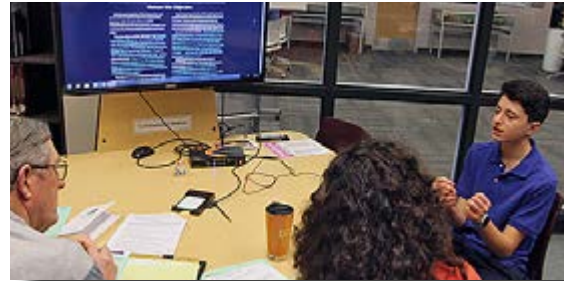
History Day 2017 in HSU Library Special Collections

The HSU Library builds connections with the youth of our community by supporting local education programs that prepare students to be successful in college. One example is McKinleyville High School. Students participate in a rigorous learning program called International Baccalaureate that, in some cases, gives them college course credits and scholarships. This program requires students to produce a research paper. Participating students needed access to more scholarly and diverse sources for their individual topics of interest. The HSU Library worked with this program by offering instruction on how to use databases and access resources. There was an entire day devoted to