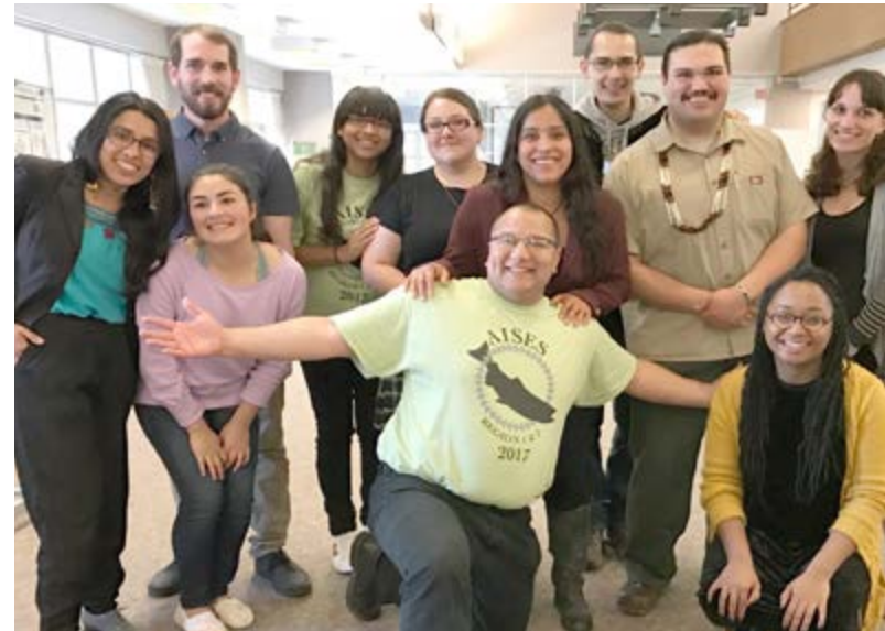
Poster Presenters, American Indian Science & Engineering Society (AISES) conference 2017 in HSU Library

For more information about our SkillShops please visit libguides.humboldt.edu/skillshops and join us.