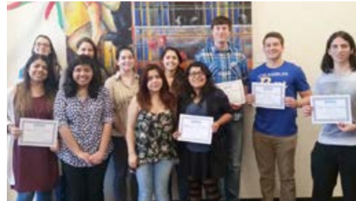
Skilled Learners at the Strawberry Festival & Skilled Learner Certificate Award Ceremony

We actively work to support our students who are developing and producing projects that connect their studies to their passions and develop their academic, professional, and personal goals. Students sharpen their information literacy through classroom instruction, SkillShops, online tutorials, and in-person and online research help.