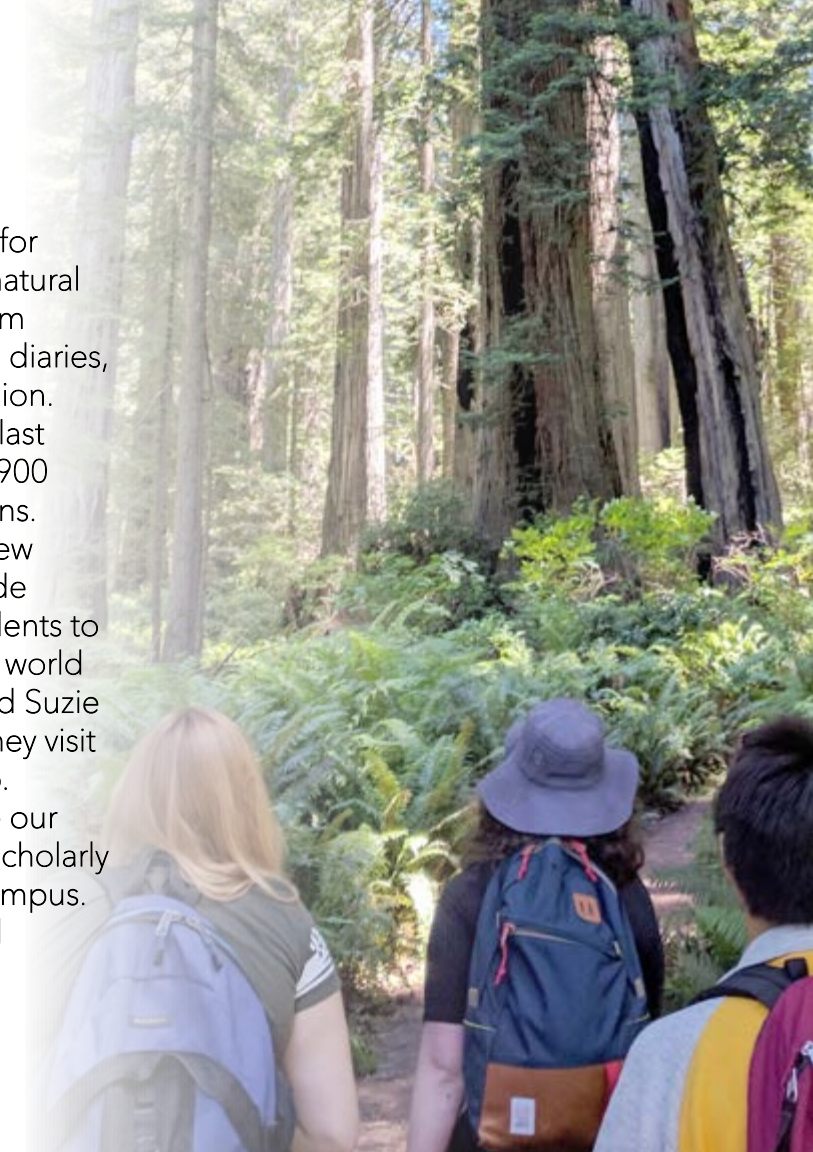
Photo right: Library Scholar Interns hike in Redwood National Park

We invite you to join us February 1, 2018, for the grand opening of Special Collections from 3pm-5pm.